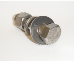
HEX CAP SCREW W/ NUT, FLAT & LOCK WASHER 304SS & 316SS