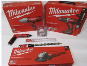
MILWAUKEE TOOLS, SDS PLUS, DRILL BITS, SAWZALL BLADES & ACCESSORIES