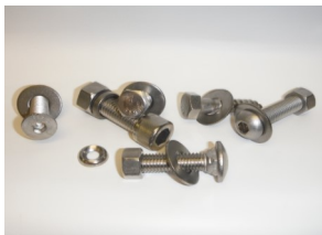
WE ARE ALL ABOUT THE STAIN- LESS! F593, 304SS, 316SS— HEX CAP SCREW, CARRIAGE BOLTS & SOCKET CAP SCREWS