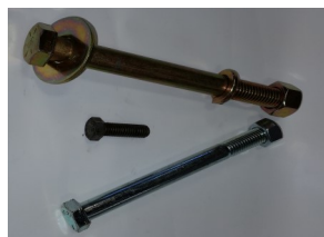
HEX HEAD BOLTS W/NUT, FLAT & LOCK WASHER GRADE 2, 5 & 8