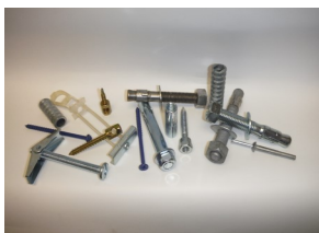
MASONRY ANCHORS (304SS, GALV, ZINC)