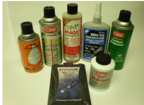
CRC, VIBRA-TITE, KANO, & TAP MAGIC LUBRICANTS, THREAD LOCKER, THREAD INSERT KITS