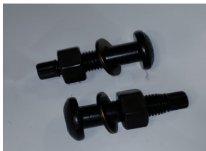
TENSION CONTROL A325 STRUCTURAL BOLTS PLAIN & GALVANIZED