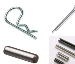
PINS - COTTER, DOWEL, CLEVIS & ROLL