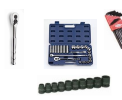
HAND TOOLS AND KITS