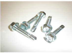
SELF DRILLING HEX WASHER HEAD TEK SCREW—410SS & ZINC