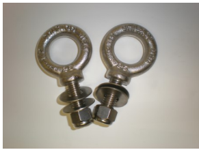
FORGED EYE BOLTS SS W/NYL INS LOCK NUTS & FLATS 304SS, PLAIN & GALVANIZED