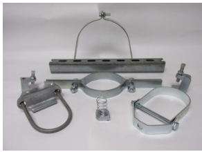
CHANNEL STRUT, BEAM CLAMPS, U-BOLT BEAM CLAMPS, RISER CLAMPS & ACCESSORIES