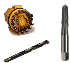
DRILL BITS (JOBBER, STUBBY, S&D) WATERPROOF CASE SET, 64PC METAL SET, TAPS (PLUG, BOTTOM, TAPER) & ANNULAR CUTTER