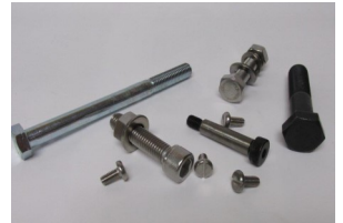
METRIC—HEX CAP SCREW 10.9, 304SS SOCKET, SHOULDER, HEX CAP, & MACHINE SCREWS