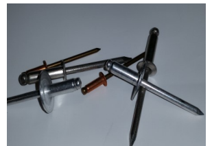
RIVETS - STAINLESS, ALUM, BRASS & STEEL