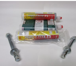
CONCRETE EPOXY & WEDGE ANCHORS