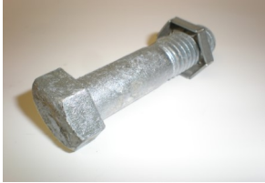
A394 TOWER BOLT & PAL NUT