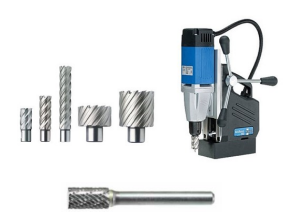
MAG DRILL, BURR BIT, & ANNULAR CUTTERS