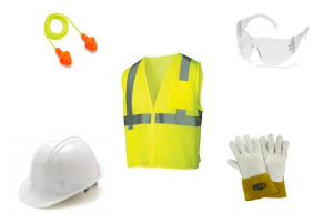
PERSONAL PROTECTIVE EQUIPMENT & SAFETY