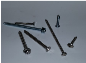
TAPPING SCREW— HEX WASHER HEAD, PAN, TRUSS, FLAT & OVAL SNAKE EYES, COMBO, PHILLIPS, SLOTTED ZINC & 410SS