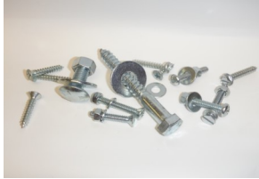
CARRIAGE BOLT - ZINC, 304SS, GALV MACHINE SCREW- PAN, ROUND, FLAT, TRUSS ZINC & 304SS