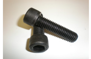
SOCKETS- SOCKET, FLAT, BUTTON, SHOULDER ALLOY, INCH, METRIC