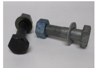
A325 STRUCTURAL BOLTS PLAIN & GALVANIZED