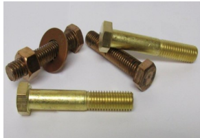
HEX CAP SCREW W/NUT & FLAT WASHER- BRASS & SILIBRONZE