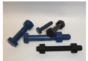
B7 MATERIAL— BOLTS, STUDS, ROD PLAIN, TEFLON COATD & GALVANIZED