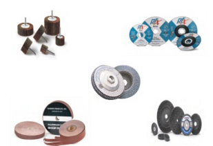
FULL LINE OF ABRASIVES (BONDED & COATED)